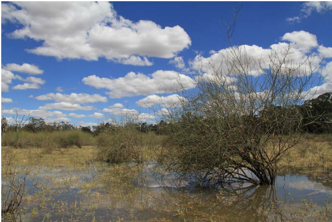
Hogwash South Wetland

Pre-works for the installation of mechanised gates at Lock 11 (Mildura weir pool) are scheduled to commence in mid-June and will take approximately one week. Installation of the mechanised gates will commence in mid-July and is expected to be completed in mid-August 2014. During this period Lock 11 will be closed to navigation.